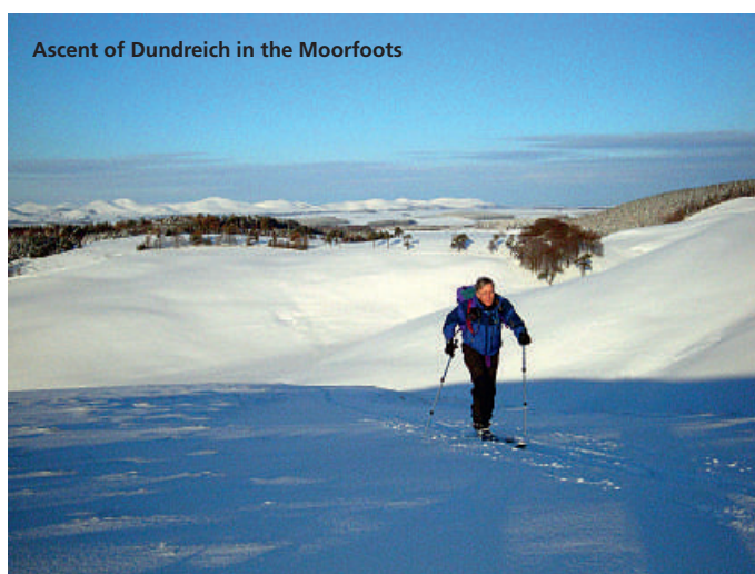
Ascent of Dundreich in the Moorfoots

In recent years members seem to have fallen from the sky with the snow, with the club now comprised of 170 members with an ability range from beginners to instructors and even racer level skiers: