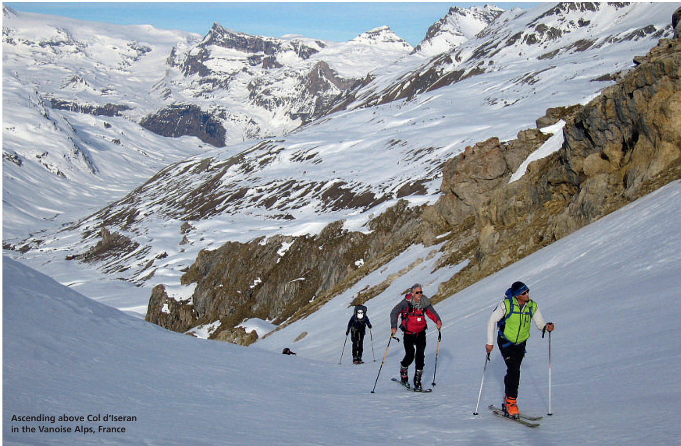
Ascending above Col d'Iseran in the Vanoise Alps, France