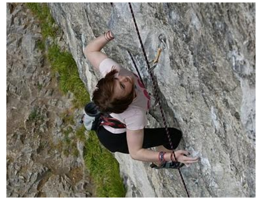
Outdoor climbing at Malham

To maintain her training programme family holidays now all include climbing.