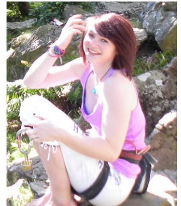
Relaxing at Dunkeld