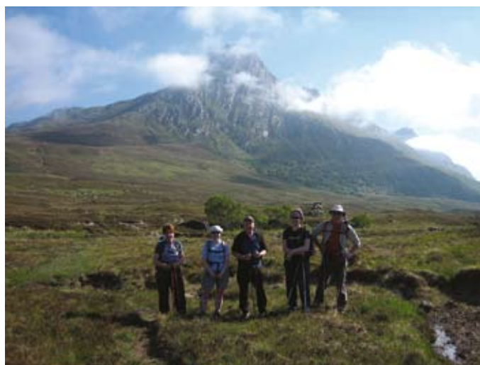
Top: 25th anniversary meet at Glen Cova, 2003