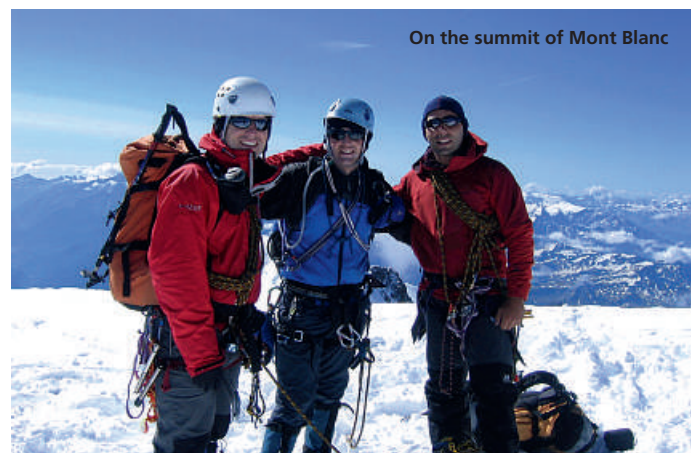
On the summit of Mont Blanc