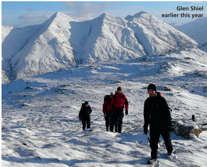
Glen Shiel earlier this year

within the club is ski touring. The recent good winters have encouraged some of the membership to look out their skins and take to the high plateaus.