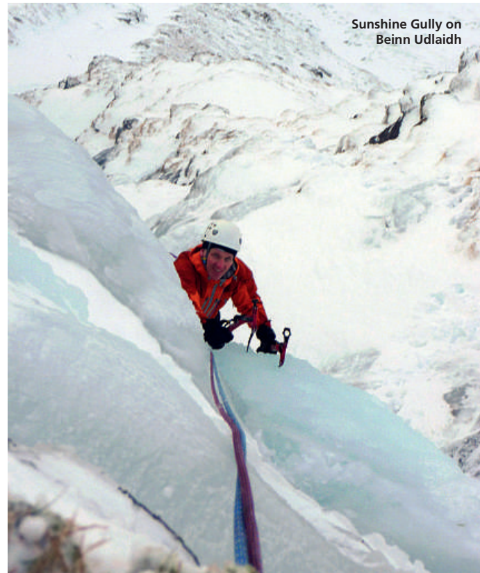
Sunshine Gully on Beinn Udlaidh