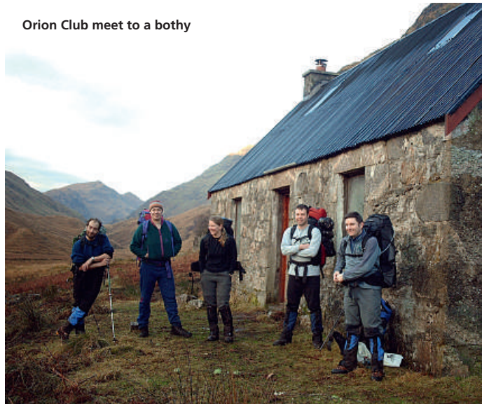
Orion Club meet to a bothy

suits us fine as it promotes a welcoming feel and seems to eliminate the cliques and falling-outs that some members had experienced in other clubs. The result is that we are basically a bunch of mates with a shared interest in the hills and climbing.